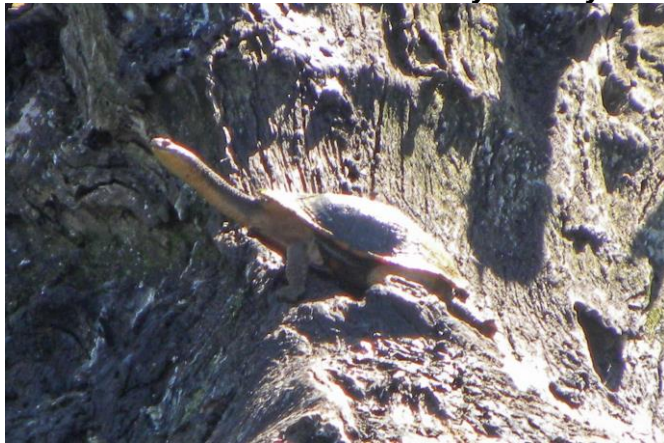
Eastern Snake-necked Turtle at Eynesbury

This Eastern Snake-necked Turtle ( Chelodina longicollis ) was also photographed in Eynesbury in September; sunning itself on the log & enjoying the early spring sun. It was first noticed here during the fearsome heatwave of last summer. Although Snake-necked Turtles are indigenous to this region it would not be found naturally in the ornamental