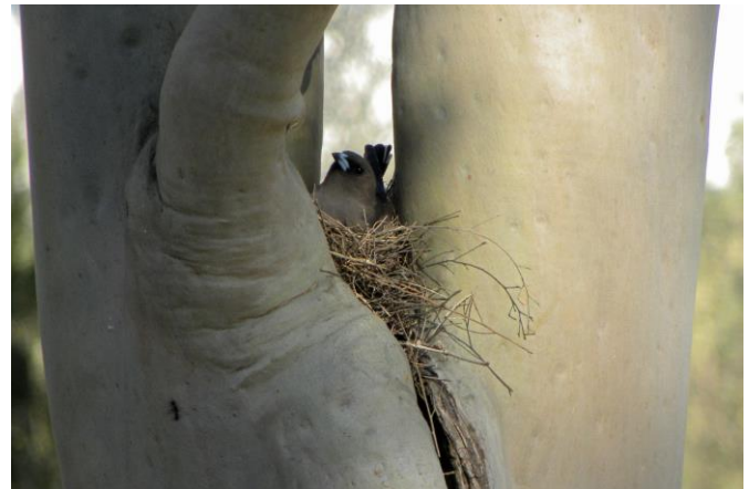
Dusky Woodswallow nest at MBG