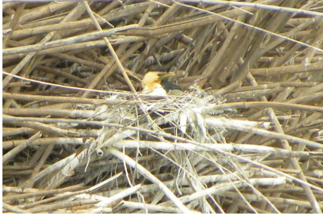
Little Pied Cormorant nest at Eynesbury

Hoary-headed Grebe Australasian Grebe Straw-necked Ibis Little Pied Cormorant Black Duck Wood Duck Chestnut Teal Freckled Duck Muscovy Duck Crested Pigeon Coot Purple Swamphen Galah Sulphur-crested Cockatoo Eastern Rosella Crimson Rosella Red-rumped Parrot Superb-fairy wren Brown Treecreeper Yellow-rumped Thornbill Little Raven White-plumed Honeyeater Mynah Starling Diamond Firetail