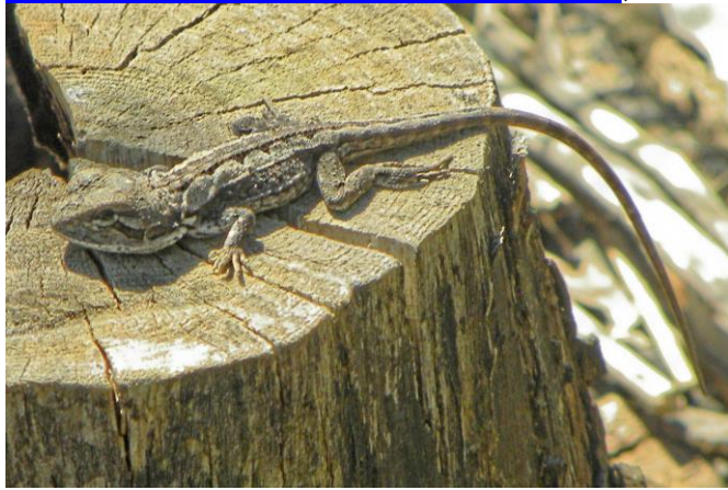
Juvenile Jacky Lizard at Eynesbury

http://museumvictoria.com.au/discoverycentre/info/sheets/lizards-found-in-victoria/jacky-lizard/ ;