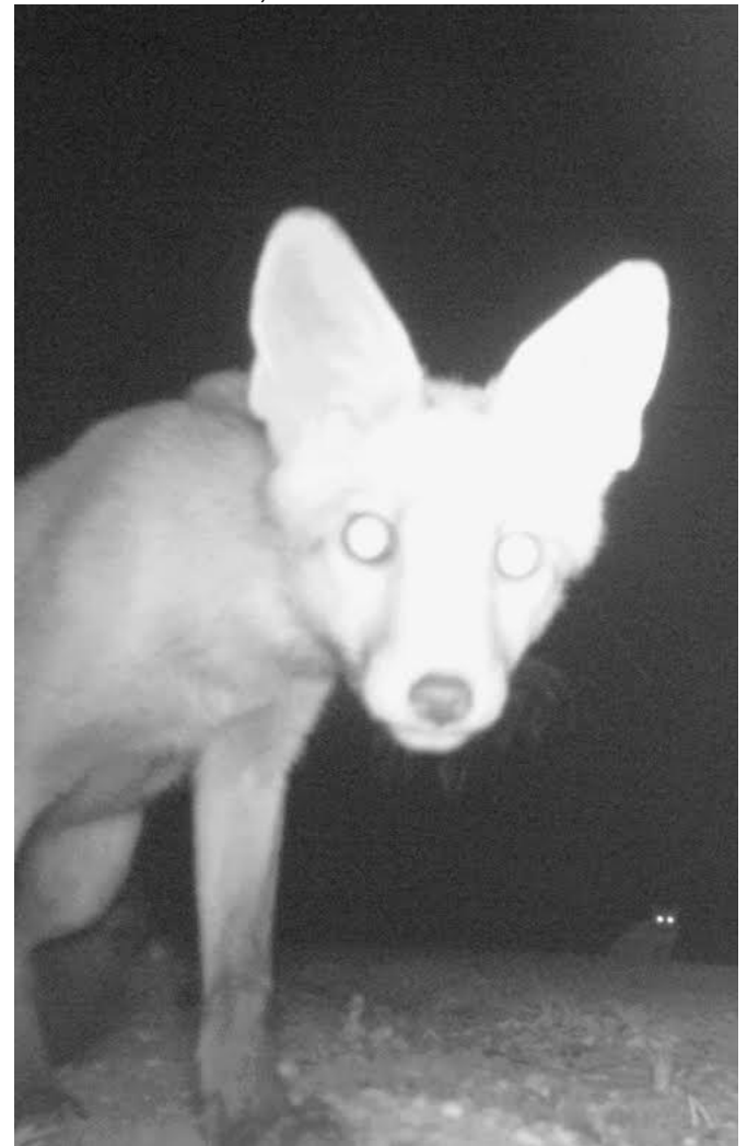
Fox at Parwan (& mystery eyes in background!)

'This month a fox investigates the camera late at night, and off in the distance - is that a young fox or a cat?' Cheers, Simon