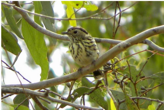
Speckled Warbler in Eynesbury January 2014

Brown Treecreeper, Speckled Warbler, Diamond Firetail