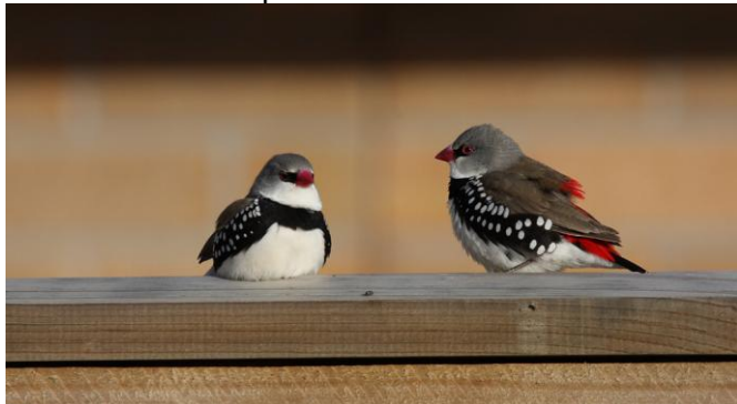
Diamond Firetails in Eynesbury

As per: Pinkerton Forest and Bush's Paddock: flora and fauna report 2007