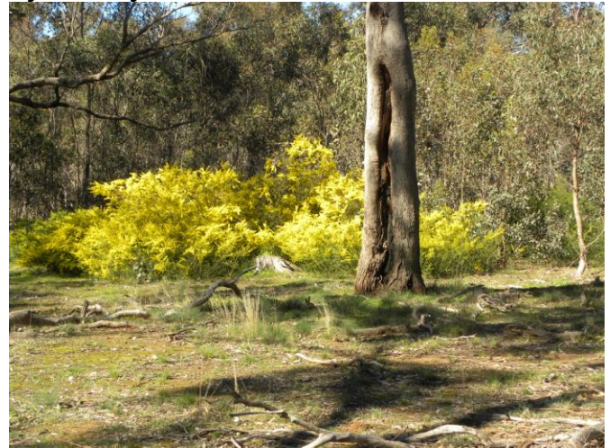
Gold-dust Wattles blooming in Eynesbury

Eynesbury Forest, at 288 hectares, is one of Victoria's largest remaining stands of Grey Box, & the largest one south of the Dividing Range. It is a reminder of the Grey Box Woodlands that once covered much of this region, along with vast areas of rolling grasslands. In springtime the woodland comes alive with masses of yellow & gold wattles & bushpeas, as well as numerous smaller wildflowers. This is one of several woodlands in this vicinity, ie Pinkerton Forest, Bush's paddock Woodland, Strathtulloh Woodland & Five Ways Woodland, Eynesbury being by far the biggest.