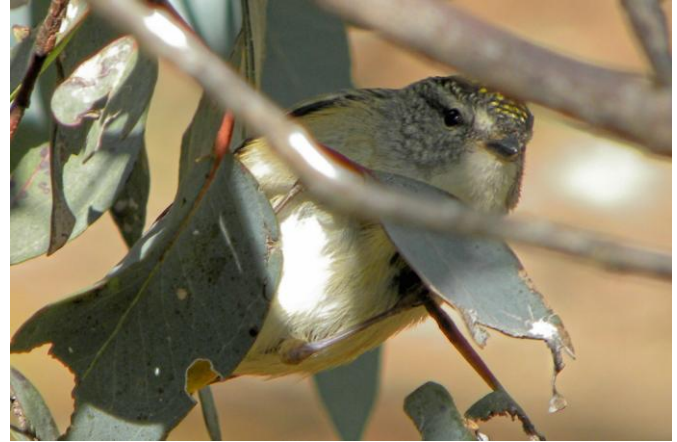
Spotted Pardalote in Eynesbury