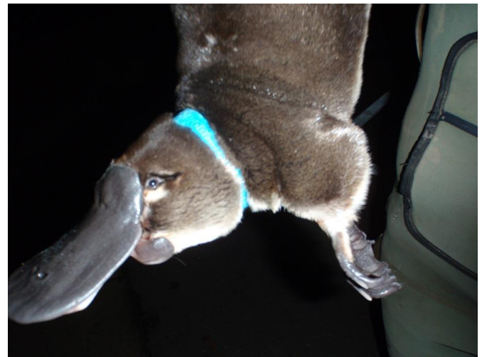
Platypus in Werribee with plastic band

Josh and I welcome ideas to try and stop these preventable deaths. Please contact me with your thoughts.