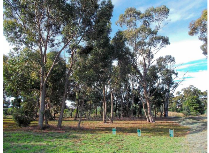
Small remnant Grey Box Woodland at Brookfield

understory, indigenous wildflowers & understory plants will be planted here. These will include Eutaxia, Indigofera, Templetonia, Melicytis, Eremophila, Bursaria Gold-dust Wattle etc. The woodland has been fenced off by treeguards to prevent the future access of mowers, to allow revegetation by the Brookfield Residents Landcare group. A four metre access track for mowing & works along the creek will be left between the woodland & the Leisure Centre fence.