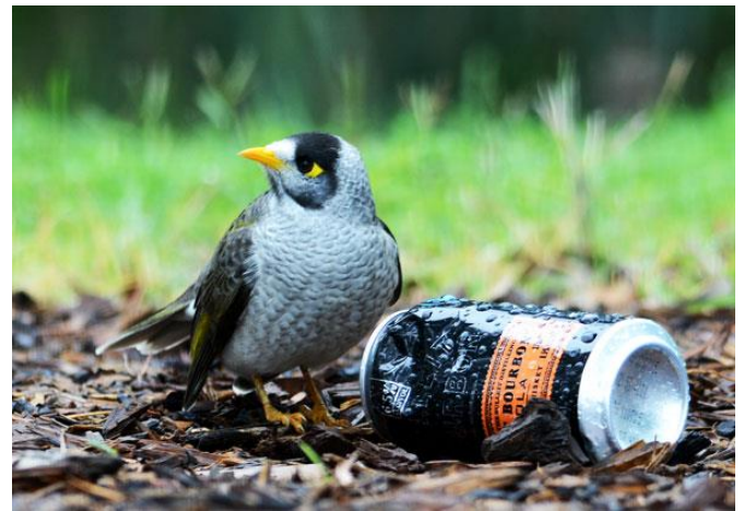
Noisy Miner at Hannah Watts Park in Melton