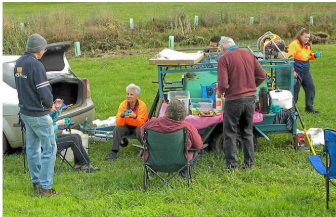
Lunch at Brookfield

Planting was easy as the ground was soft & wet after recent rains & the weeds had been removed by Western Land Services. In fact no watering was required due to the wet conditions! Soaking rains the following Monday morning should ensure their survival. Our local mascot bird, the Willie Wagtail with no eyebrows, inspected the new plants in detail as we finished, no doubt hoping for uncovered worms!