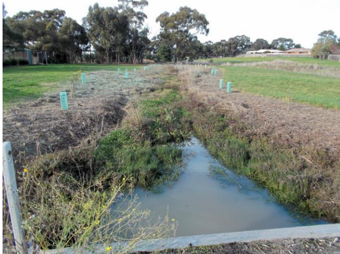
Tributary creek sprayed & brushcut by WLS

The small tributary creek at Brookfield has been sprayed & brushcut by Western Land Services (WLS), funded by Melbourne Water Grant to the Brookfield Residents landcare group. The grant will fund also weed matting for the creek side as well as plants, tools & equipment for use by the residents group.