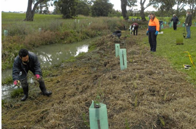
Planting at Brookfield

Acacia provincialis Golden Wattle Acacia verticillata Blue Box Leptospermum lanigerum Dodonea cuneata Callistemon sieberi Lomandra longifolia Poa labilliere