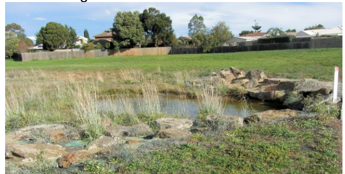
Brookfield rock pool

WLS also removed Phalaris & other weeds from the pretty little rock pool located behind the Leisure Centre. This pool will be planted with wetland plants & wildflowers, such as Juncus, Billy Buttons, Marsh Marigolds etc.