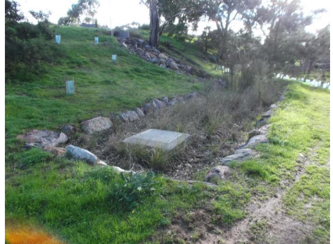
Litter trap at Toolern Creek

Litter traps have been installed at storm water outlets to keep rubbish from the creek. Reed beds trap pollution and sediment, preventing it flowing into the River and ultimately Port Philip Bay. Plantings by the water's edge keep detritus from the creek.