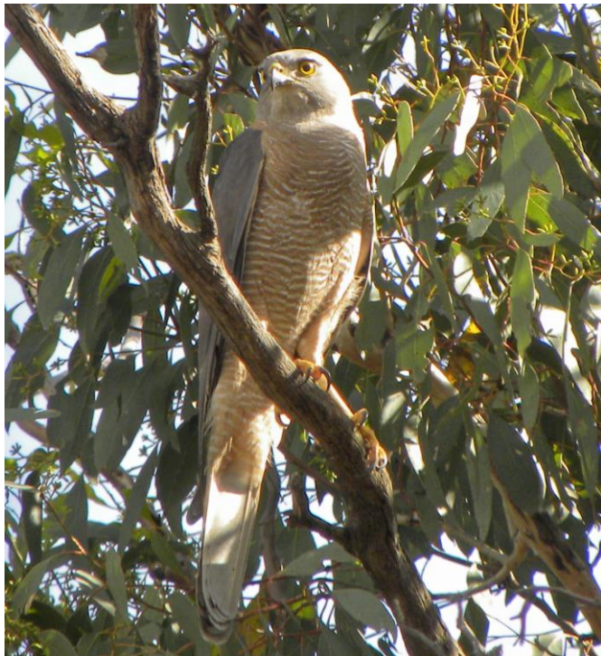
Juvenile Brown Goshawk at Harkness Road

"Yes, I doubt a Hobby would take a chicken but all birds seems to be able to recognise raptors and get frightened. Most common bird hunter around Melbourne would be the Brown Goshawk - Grey are pretty uncommon."