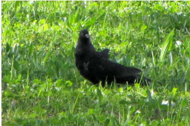
Pigeon dropped by Whistling Kite at Brookfield

remnant Grey Box Woodland, with a bird in its talons. Initial reaction was that the identification must be mistaken, & the raptor must have been a Brown Goshawk. Brown Goshawks & Collared Sparrowhawks are commonly seen in Melton, both along our creeks & in gardens. A few minutes later it flew off, dropping the bird between the fence of the recreation centre & the creek. However it was definitely a Whistling Kite, about twice the size as the Magpies. As it took off it dropped the bird, circling into the Red Gums. The air was then filled with noisy bird cries as the large raptor flew over the trees, Rainbow Lorikeets being the most raucous of these.