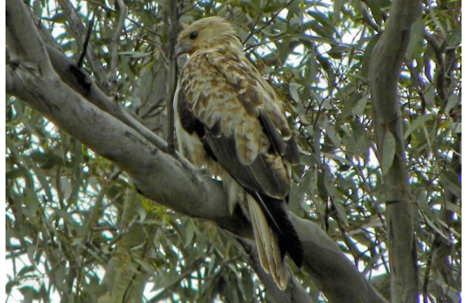
Whistling Kite in Eynesbury Forest

A new species for Brookfield & a brief insight into raptor behaviour in the middle of Melton.